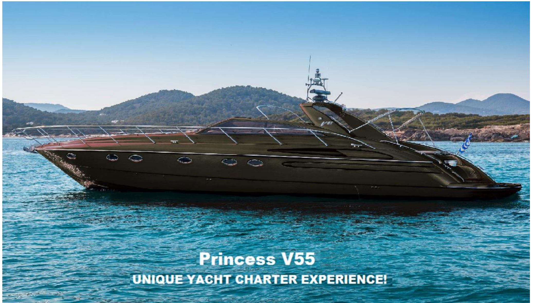
Princess V55 UNIQUE YACHT CHARTER EXPERIENCE!